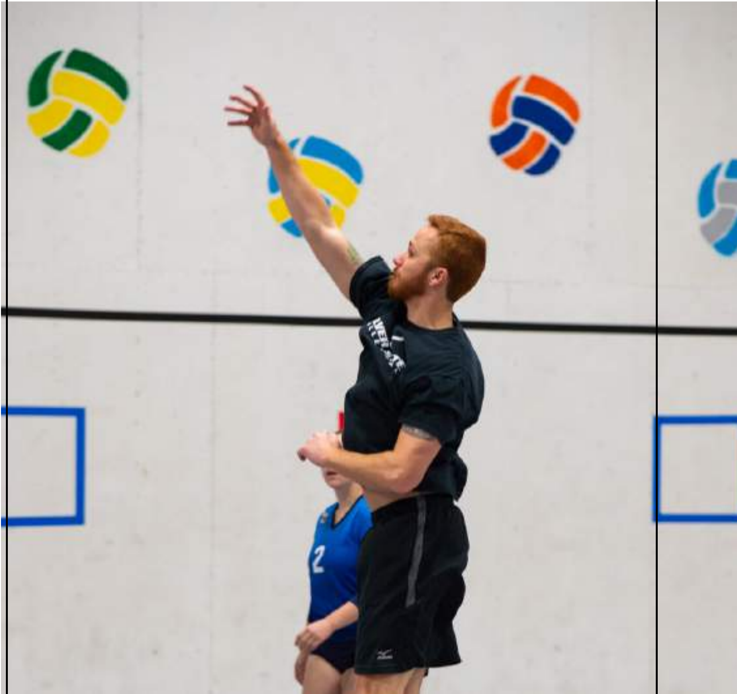
SSVC BOYS VOLLEYBALL